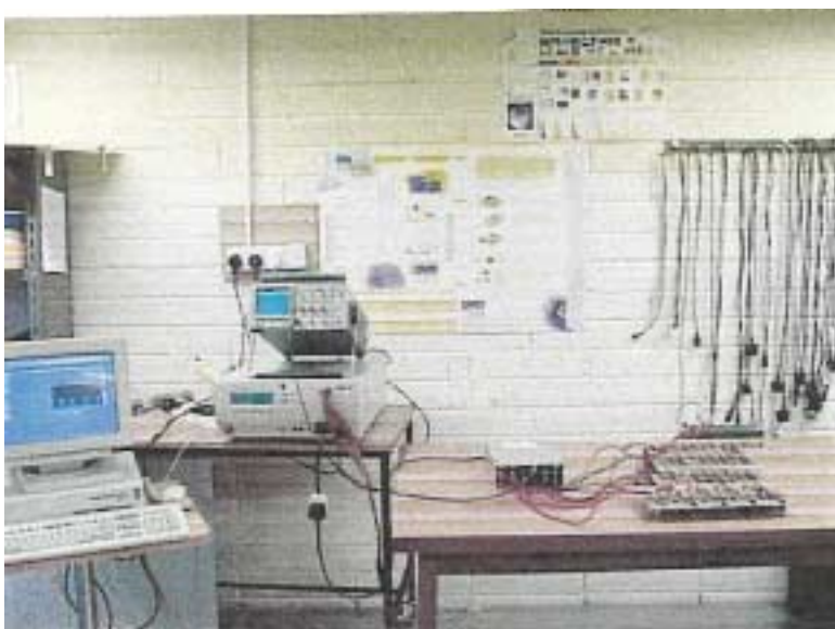
Figure A4. EFT / Surge immunity test set-up