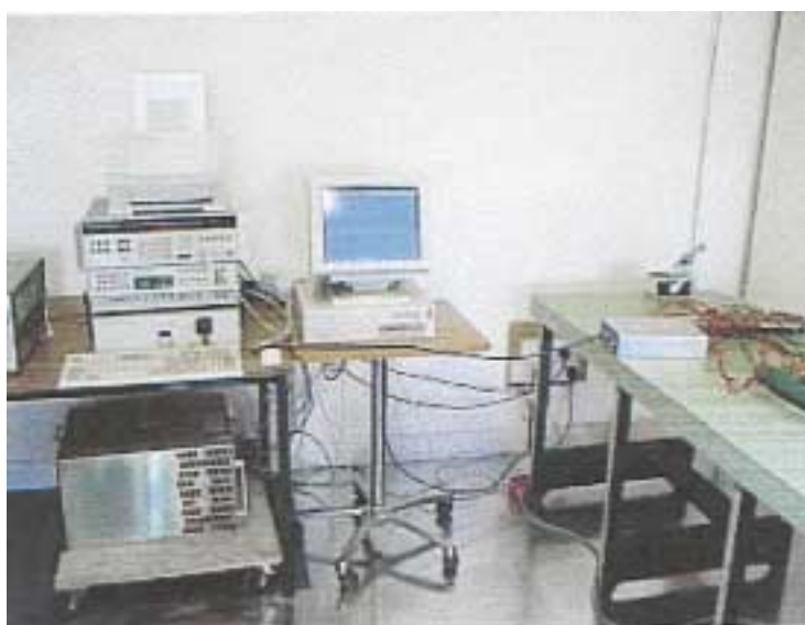
Figure A2. Steady state harmonics test set-up