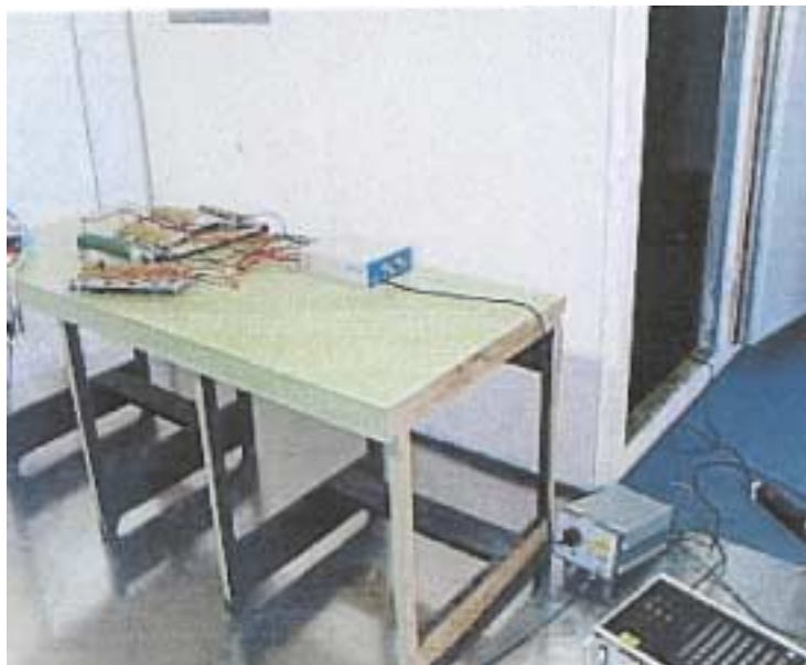
Figure A1. Conducted emissions test set-up