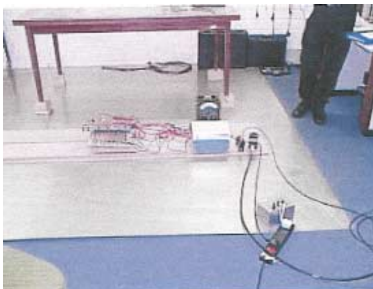
Figure A5. conducted immunity test set-up